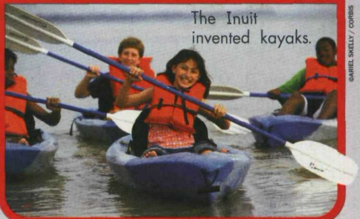
The Inuit invented kayaks.

Today, people love to race kayaks. It is even a sport in the Olympics!